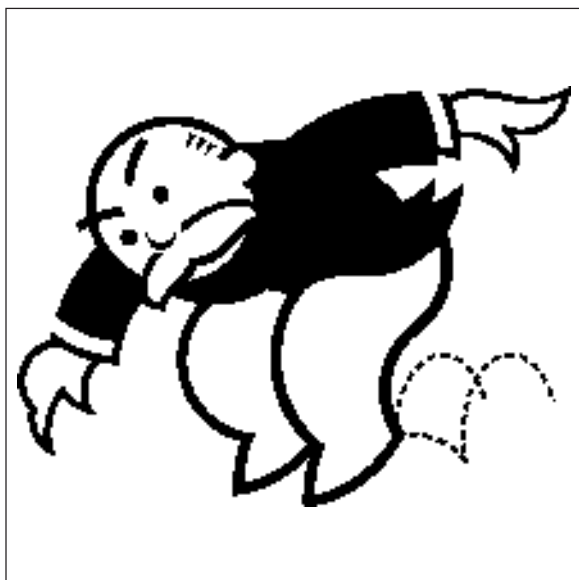
WRONG - Line Art Scanned at 75 ppi*