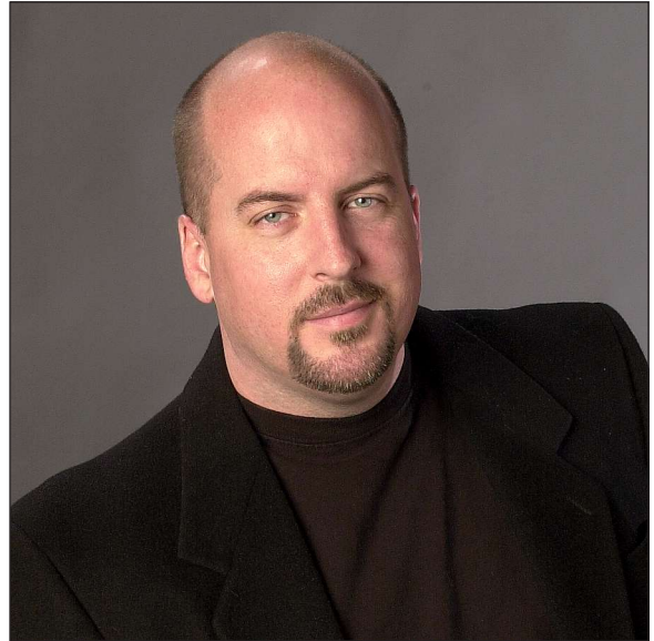
CORRECT - Professional Studio Portrait