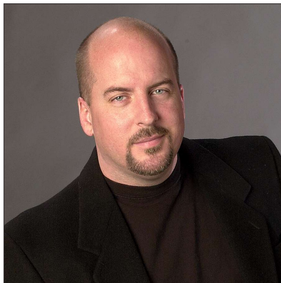
CORRECT - Photo Scanned at 300 ppi*