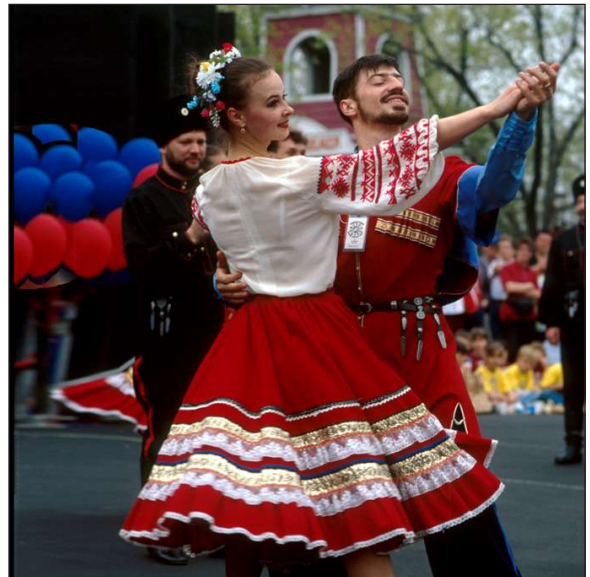
CORRECT - The image is engaging. It has movement and shows excitement and involvement. It tells a story about the event. The image doesn't try to show every aspect of the event but instead shows the energy of one even which represents the whole event.