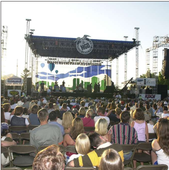
WRONG - No focus, doesn't tell a story.