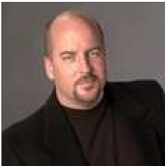
WRONG - Photo Scanned at 75 ppi*