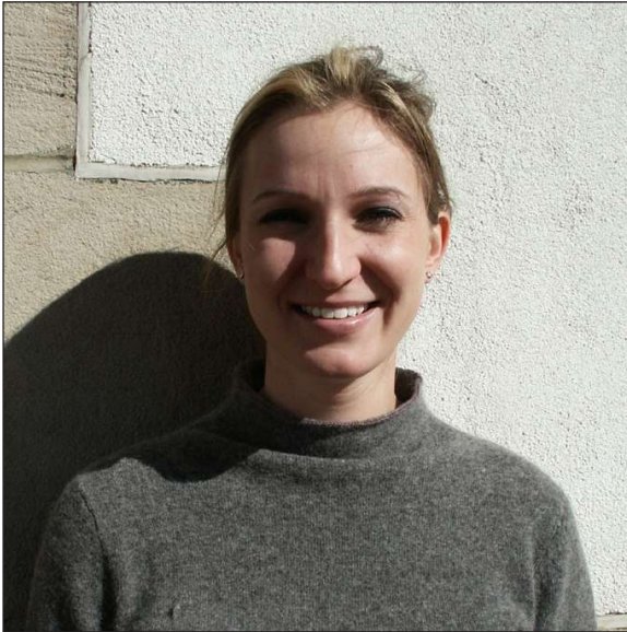
WRONG - Poor lighting, strong shadows, bad background, too close to background, uneven color.