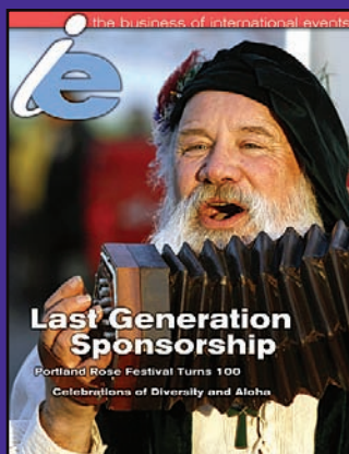
On the Cover: Traditional Irish folk tunes being sung at BorderFest 2007 "A Salute to Ireland", Hidalgo, TX.