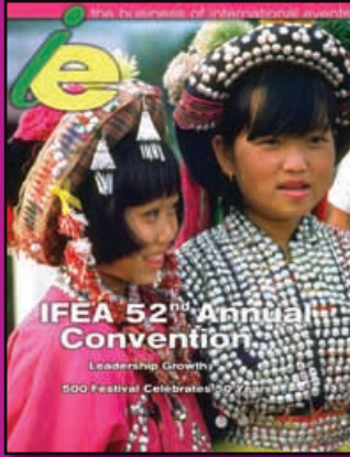
On the Cover: Two young Asian girls celebrate their cultural heritage through a local festival.