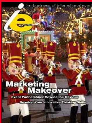
On the Cover: Disney's Very Merry Christmas Parade, Disney World, Orlando, Florida.