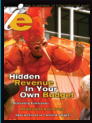
On the Cover: A performer from the Cherry Creek Arts Festival in Denver, Colorado held in July.