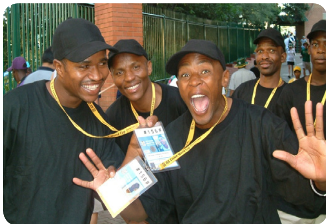
Volunteers gaining workplace experience

“Education is the most powerful weapon which you can use to change the world.” Nelson Mandela