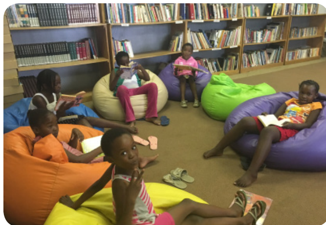
Youth from the local neighbourhood @ The Library

O n the 11th of February, 1990, Nelson Mandela was released from prison. I was in Cape Town on that miraculous day to see and be a part of history happening in our time. In 1993, I had a young intern working with me for workplace experience and he asked whether I would do the décor for a man who had been in prison and had never had a Birthday Party – I said of course and on the 17th of July, 1993 my company and I were privileged to be the event decorators for Mr. Mandela’s 75th Birthday. I have treasured the signed thank you letter he wrote, and it was wonderful to see his leadership in action towards the acceleration in education in our country. Events can play a big role in respect of education – from a Design Thinking Methodology/problem solving, small low-key events create extended opportunities for ‘failure’ in a safe environment.