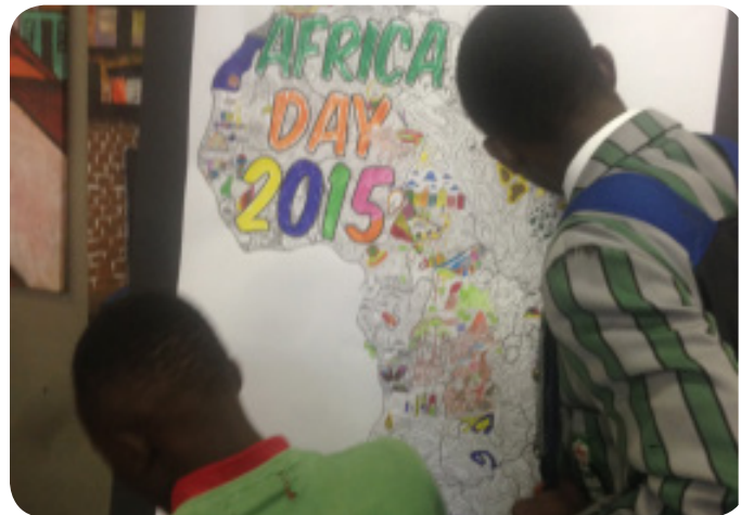
Africa Day Art

job done and making a difference in the lives empowered in the process.