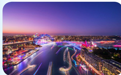
Sydney New South Wales, Australia

Sydney is Australia's creative heart; it thrives on technological advancement and