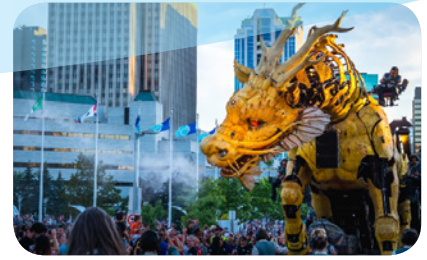
Ottawa, Ontario, Canada

Ottawa is Canada's capital, and a welcoming, diverse, and vibrant home to approximately one million residents. Located in the eastern portion of the province of Ontario, Ottawa is the fourth-largest city in Canada and a destination alive with celebration and pride in its heritage and multiculturalism. From the historic Byward Market to the picturesque cascades of Chaudière Falls, Ottawa is a place where urban verve meets awe-inspiring greenery. With momentum from Ottawa's record-setting Canada 150 celebrations in 2017, Ottawa continues to embrace and champion the integral role that festivals and events play in our city's effervescent spirit.