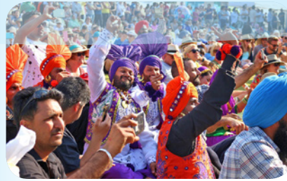
Coffs Harbour New South Wales, Australia

The City of Coffs Harbour is a major regional city on the Mid North Coast of New South Wales, midway between Sydney and Brisbane. It is the principal city of the tourism destination known as Coffs Coast, which also includes the delightful seaside and hinterland communities of Bellingen, Sawtell, Coramba and Woolgoolga. Highly valued as a place to live and a popular holiday destination, Coffs Harbour continues to attract people seeking a lifestyle change or place to enjoy a diverse and expanding range of festivals and special events