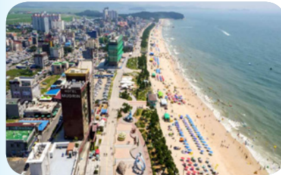
Boryeong-si Chungcheongnam-do, South Korea

Boryeong has been referred to as Manseji Boryeong. Their people have been blessed for generations to respect the old and