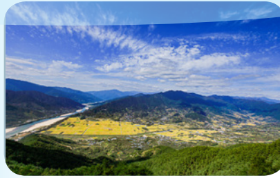
Hadong-gun Gyeongsangnam-do, South Korea

Hadong includes Jirisan National Park, the Seomjin River and Hallyeosudo and is the first place in Korea where green tea was planted. The area is rich in unique foods, agriculture and indigenous products during four seasons including wild tea, Daebong persimmon, plum, strawberries, chestnut, corbiculae, green tea and Yellow Mullet. Three small but competitive festivals represent the Hadong region including the Hadong Tea Festival, the Bukcheon Cosmos and Buckwheat Festival and Alps in Korea Seomgin River Marsh Clam Festival. Click Here to view Entry Click Here to view Video