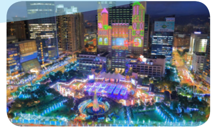
New Taipei City Taiwan

Situated in the northern part of Taiwan, New Taipei City wholeheartedly integrates religious, cultural, sporting, and other events that display Taiwanese artistry and innovation. The picturesque natural landscape makes New Taipei City abundant in tourism resource. The famous natural parks, hot springs and the Northeast Coast known for its beautiful mountain and ocean view have attracted numerous tourists and taken their breath away. Highly valued as a multicultural society, the city continues embracing traditional as well as foreign festivals and showcasing its passions for innovation and preservation. Click Here to view Entry Click Here to view Video