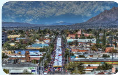
Tucson Arizona, United States

Tucson, population 530,706 (pop. 1,016,206 in its MSA) is the second-largest city in Arizona, located in the southeast part of the state, in Pima County, 65 miles north of the Mexican border. Surrounded by five mountain ranges—“sky islands” rising above the Sonoran Desert valley—Tucson is the longest continuously inhabited site in the U.S. and was part of Spain and Mexico before joining the United States. Its culture reflects these roots. Home to the University of Arizona, a premier research university ranked high nationally in many fields of study, Tucson is an incubator to growing high-technology industries in the fields of biosciences, defense, aerospace, and mining equipment. Blessed by virtually endless sunny days, Tucson is a year-round destination for outdoor enthusiasts, nature-lovers, and competitive athletes. Tucson has been investing in its transportation infrastructure, including a regional multi-use recreational path (The Loop) and a streetcar circulator connecting business districts and the university campus in the central city area. Investment in the downtown area has been significant in recent years and is gathering momentum with the development of new housing, hotels, restaurants, and entertainment venues. Click Here to view Entry Click Here to view Video