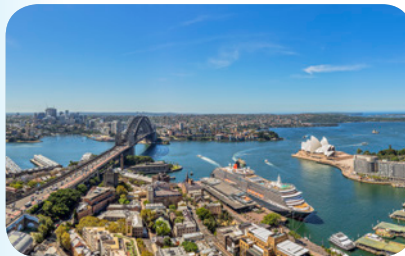
Sydney New South Wales, Australia

Sydney is a city that channels its extraverted creative energy into expressive events that engage the nation and the world. Its beautiful natural environment, welcoming spirit and exuberant joy in celebration have always set Sydney apart as an event destination; now too Sydney’s thriving creative industries are adding a layer of technological brilliance to its event delivery while construction of transformative new event infrastructure is ensuring a future in which Sydney will continue to excel. Click Here to view Entry Click Here to view Video