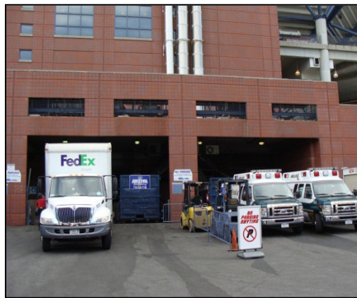
Figure 4: Deliveries (USTA)

Temporary contractor vehicles, equipment vehicles, and tour buses parked within the access control area should be inspected, issued a parking pass/window sticker, and parked in designated areas based on work being performed (refer to venue's parking procedures).