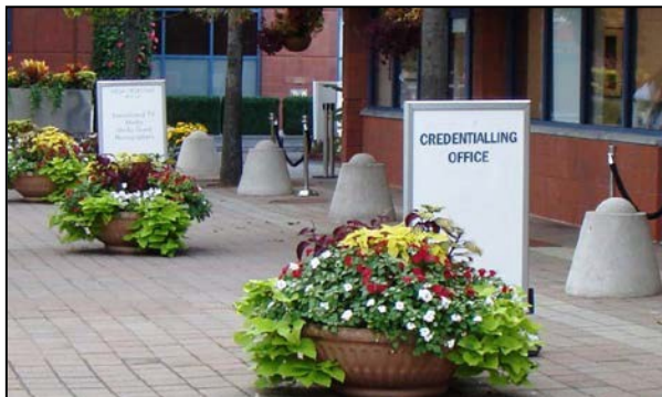
Figure 1: Credentialing Office (USTA)