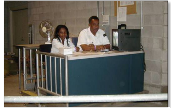
Figure 2: Security Desk (NFL)

On nonevent days, access to the venue should be restricted to designated entrances based on job function (e.g., venue personnel, contractor, media, and event staff).