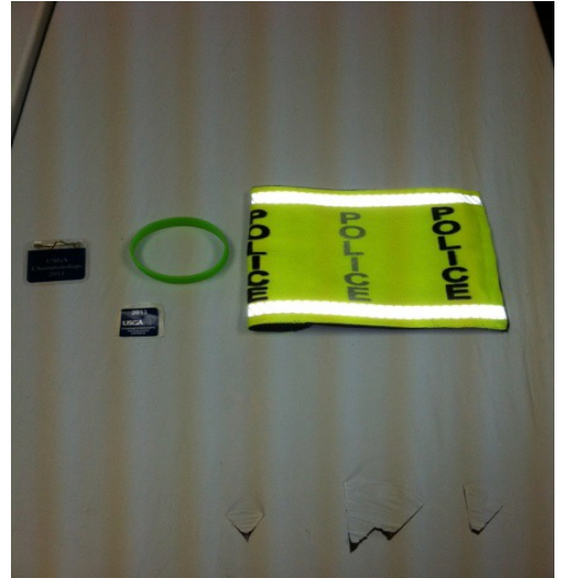
Figure 6: Arm Band (USGA)

Venues should consider assigning a security staff member to each team's locker room doors to ensure that only approved persons are admitted.