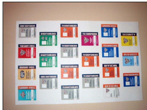
Figure 3: Sample Credential Board (MLB)