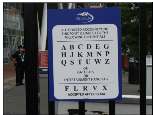
Figure 5: Credential Board (USTA)

Credentialing of local law enforcement should be considered during an event. It is important for event and security staff to be able to identify law enforcement whether in uniform, plain clothes, or undercover. It also allows the event organizers to identify those officers who are there on official duty and those who are not.