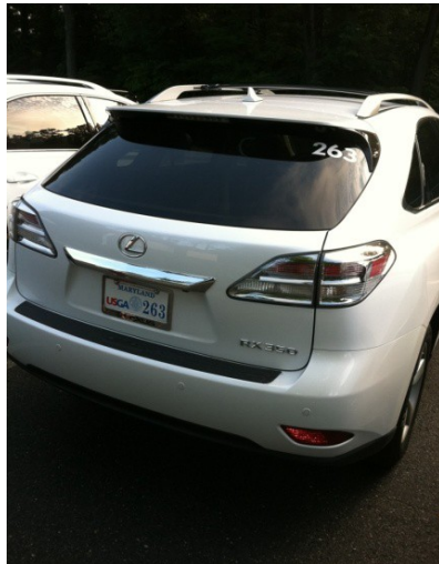
Figure 7: Courtesy vehicle (USGA)