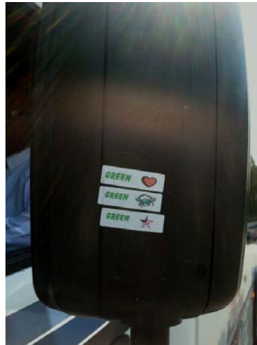
Figure 8: Shuttle bus stickers (USGA)